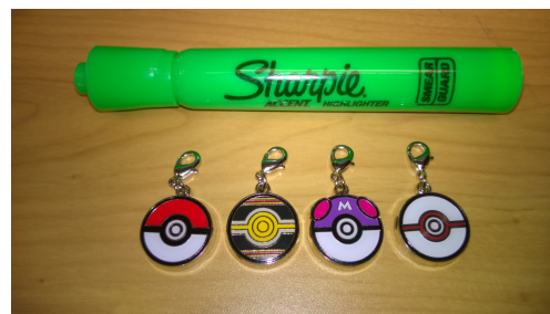
Pokeball Charms: (Left to Right): Pokeball, Luxury Ball, Mega Ball, Premier Ball.

Casual Play – The player who best represents the Spirit of The Game, as determined by the League Owner or assigned League Leaders wins this achievement.